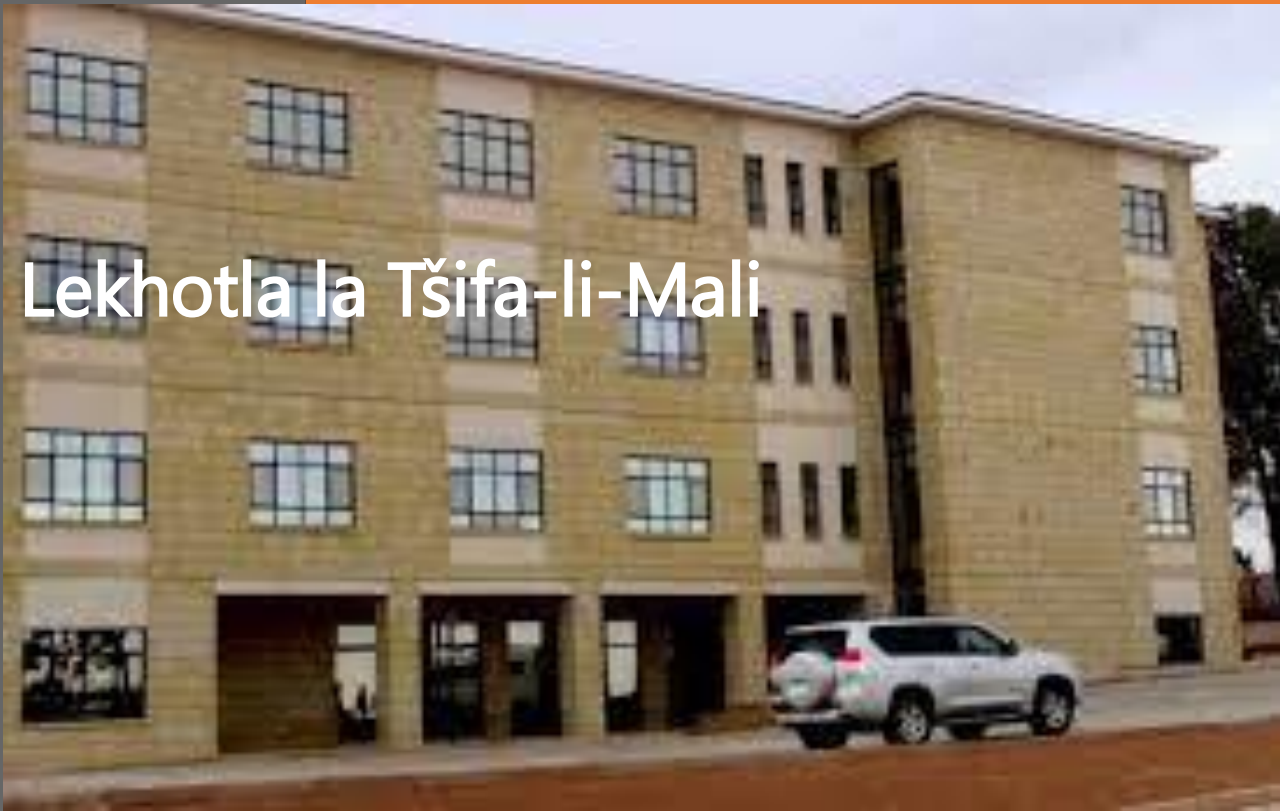
Lekhotla la Tšifa-li-Mali